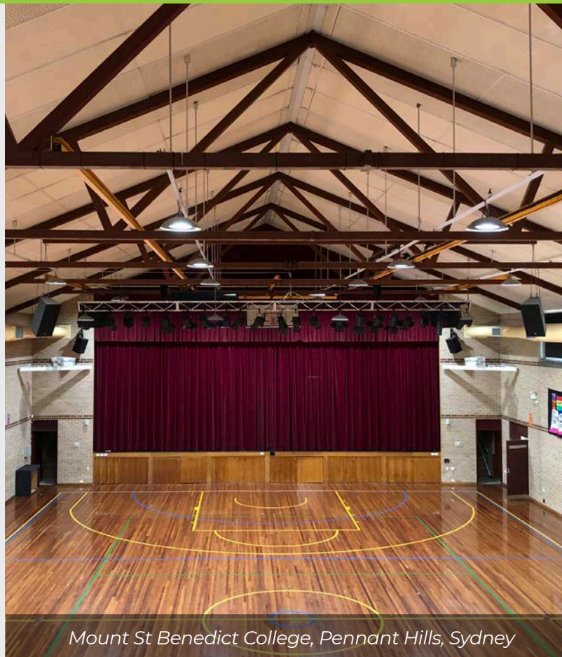
Mount St Benedict College, Pennant Hills, Sydney