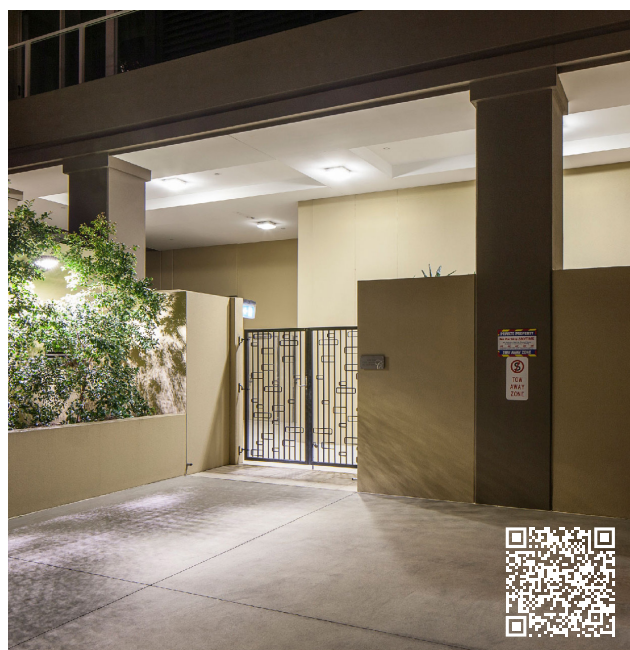
Castlebar Cove Apartments

We are deeply committed to ensuring our fittings provide dark sky compliance and we aim to minimise obtrusive light and light pollution in the areas we are tasked to provide lighting solutions for.