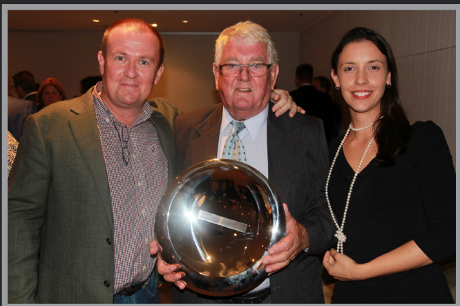
National Energy Efficiency Project winners

We are a privately owned Australian innovation company. The enLighten product range is designed by us and manufactured exclusively for us.