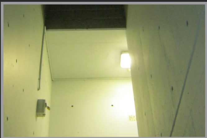
Southbank apartments fire stair installation