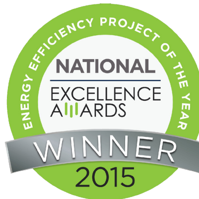
National award winner - best energy efficiency project