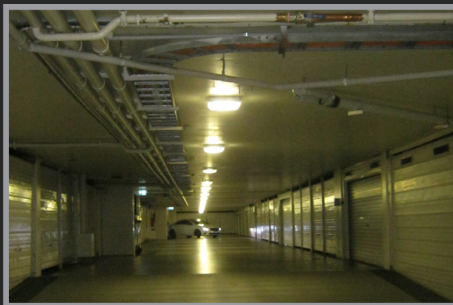
Chamaeleon light in undercover car park