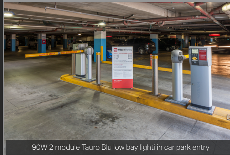
90W 2 module Tauro Blu low bay light in car park entry