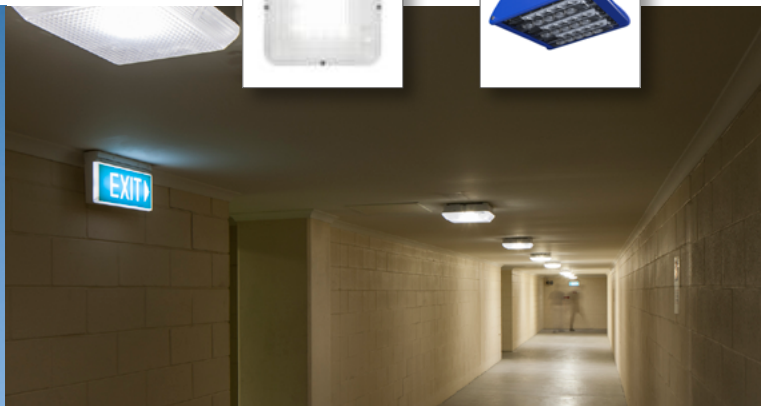
Chamaeleon light in back of house corridor