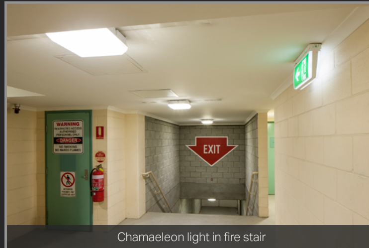
Chamaeleon light in fire stair