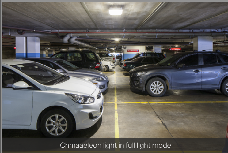
Chamaeleon light in full light mode

We are a privately owned Australian innovation company. The enLighten product range is designed by us and manufactured exclusively for us.