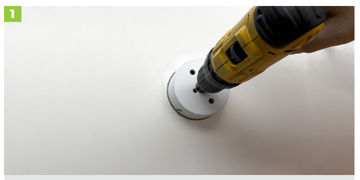
Mark the position of the fitting at the desired ceiling location and provide a 75mm - 150mm diameter cutout